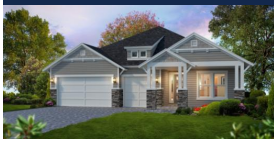
THE CRAFTSMAN MODERN