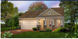
THE CRAFTSMAN MODERN